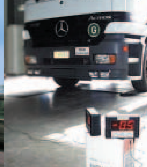
Highly professional truck tyre specialists equipped with the most technically advanced tools throughout Europe.