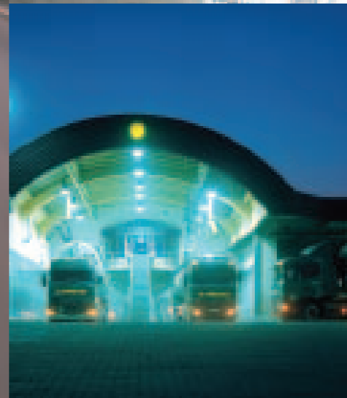
TruckForce: a Pan-European truck tyre management network. Unrivalled service standards. Expert assistance and information.