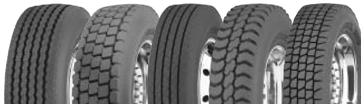
Premium quality, truck tyre products from Goodyear to suit any hauling application. Fitted anywhere in the TruckForce European network.

As a TruckForce customer, you are assured of expert advice on recommended products, on how computer monitoring can maximise the lifecycle of your tyres and on any local legal issues regarding truck tyres. When you call TruckForce, you'll be dealing with a staff of knowledgeable professionals trained by Goodyear Dunlop specialists using the most technically advanced tools available. With a comprehensive range of dealerships throughout Europe, you are never far from fast, efficient, friendly help. And remember that all work carried out is conveniently charged directly to the subscribing truck company.